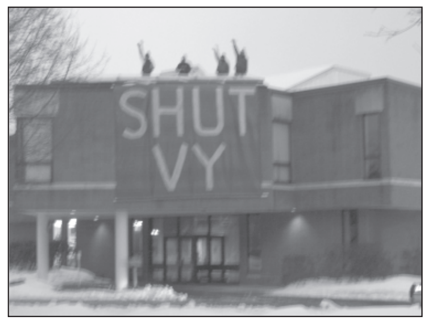
Protestors drop a banner at Entergy headquarters in Brattleboro last March.

Even though there were no major victories, 2007 has been one of the most exciting and eventful years in CAN's history! Certainly there have been years with greater accomplishments we could point to ... like 1992, when we shut Yankee Rowe and proved that a small community could take on the nuclear industry and win ... or 1996, when we helped shut down all four nukes in CT, two of them permanently ... or 2002, when we organized the People's Summit on High-Level Waste, a nation-wide caravan to fight Yucca